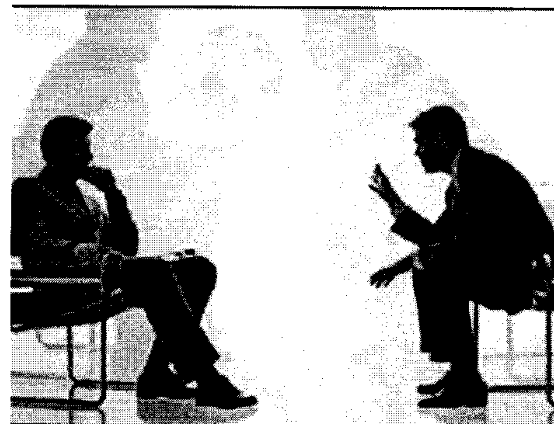
The Prime Minister's Office had recently raised concerns on the draft Preferential Market Access (PMA) norms and suggested that the 'security' and 'manufacturing locations' be delinked from the policy, while warning the new rules could create market distortions.

The draft response to the PMO adds the rules will apply to both government contracts as well as orders by private companies, but states that the 'list of products having security implications were being decided by an expert committee with rationale, and only active wireless products that are vulnerable to security of network' would have to be manufactured indigenously.